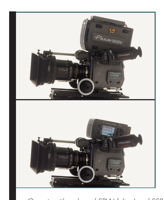
Genesis with on-board SRW-1 (top) and SSR-1